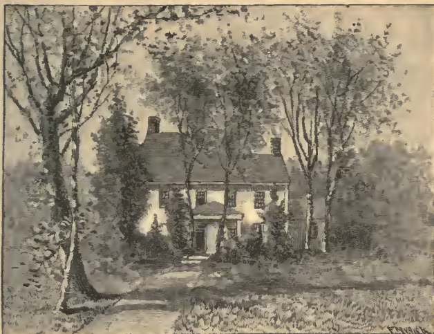
Bayard Taylor's Early Home.